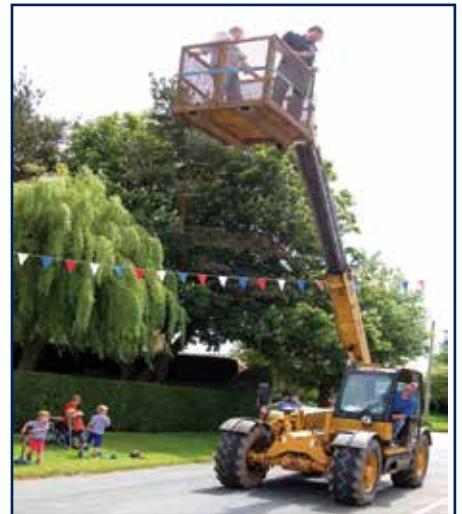
Cherry picker with our photographers

Finally, a Service of Songs of Praise held in Roos Church brought the weekend