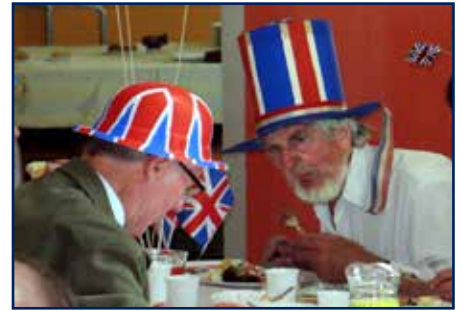
A couple of hats