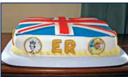
The WI Jubilee Cake