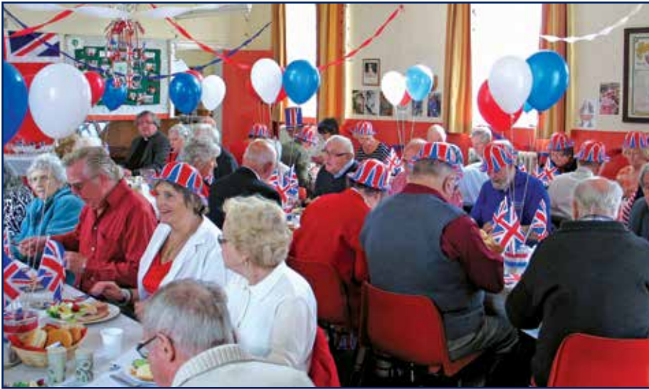
WI Party in full swing