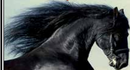
The Black Horse, Main Street, Roos 01964 670405