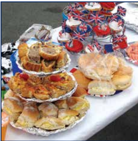
A mountain of cakes

I'm sure that everyone would wish to join in congratulating the Jubilee Committee and all those who helped in any way to make it such a huge success. It could not have gone better and it far exceeded the expectations of the Jubilee Committee.